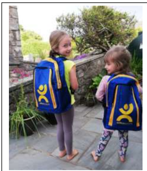
and four proud backpack wearers

Excellent results - raising money for worthy causes and supplying villagers with what they wanted