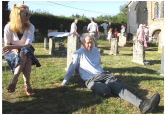
Practising 'How to take it easy?'