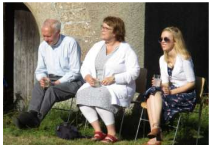
Wimsett family contemplation...of life to come in Teignmouth?